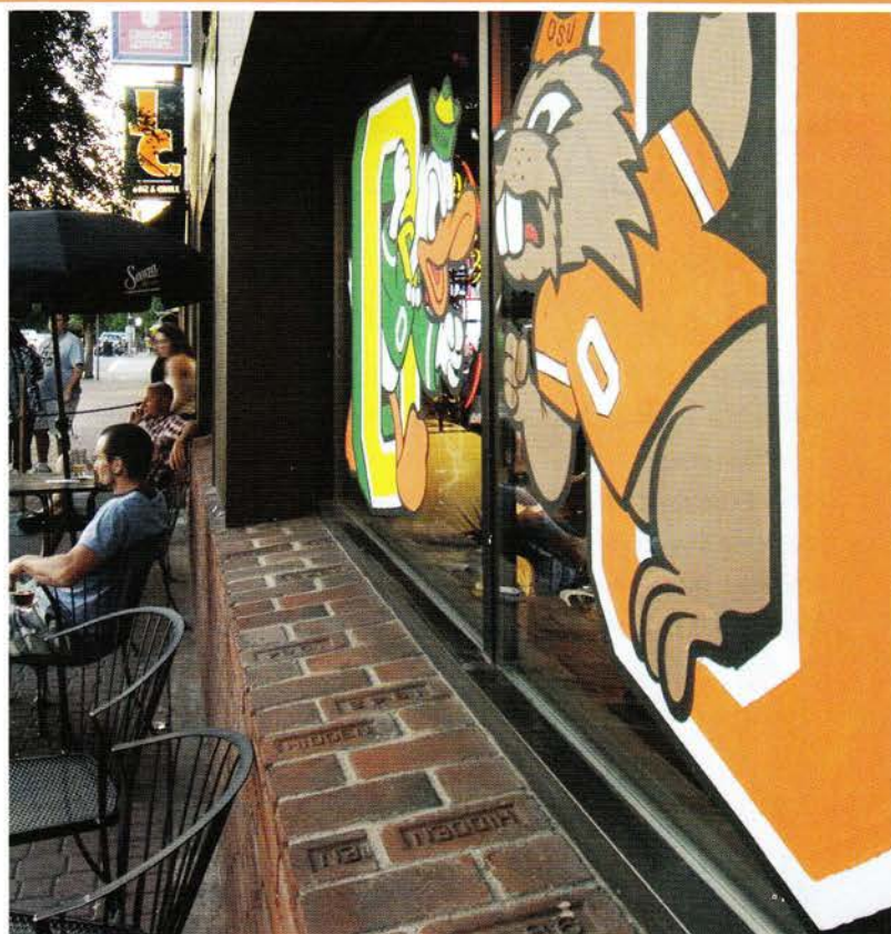
JC's Bar and Grill in downtown Bend is a favorite gathering place for sports fans of all stripes.

1020 SW Indian Ave. Ste. 100 • Redmond, OR • 541-923-4663